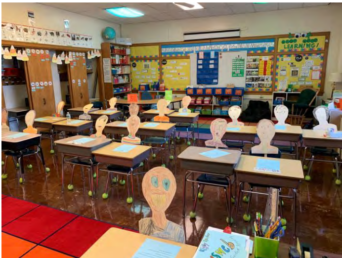
The calm before the storm...